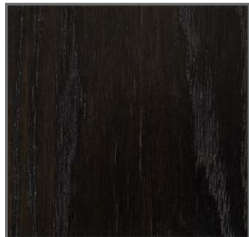
JET BLACK B1907-D612