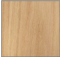
CLEAR BASE B1900-D612