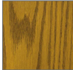
AMBER OAK B1903-D612