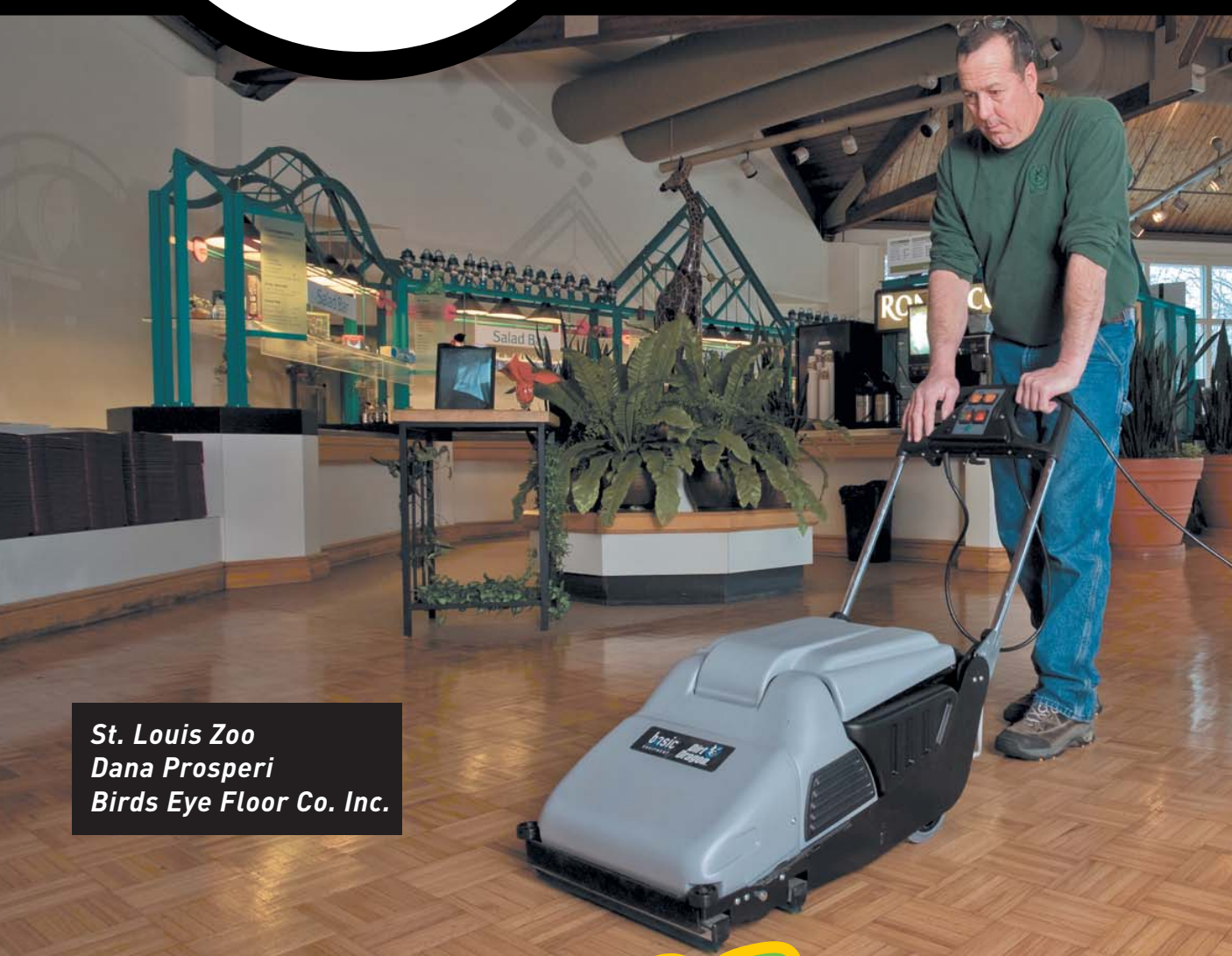
St. Louis Zoo Dana Prospero Birds Eye Floor Co. Inc.