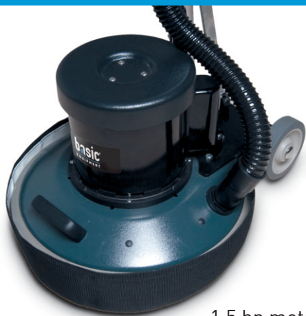
1.5 hp motor with triple-planetary stainless steel gearbox