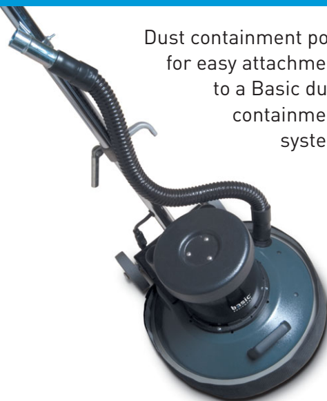
Dust containment port for easy attachment to a Basic dust containment system