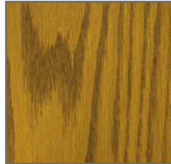
AMBER OAK B1903-D612