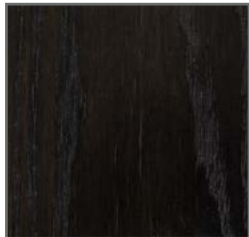
JET BLACK B1907-D612