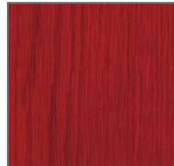
DEEP RED B1910-D612