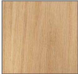
CLEAR BASE B1900-D612